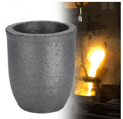
Silicon Carbide Crucible