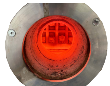
100mm diameter quartz window